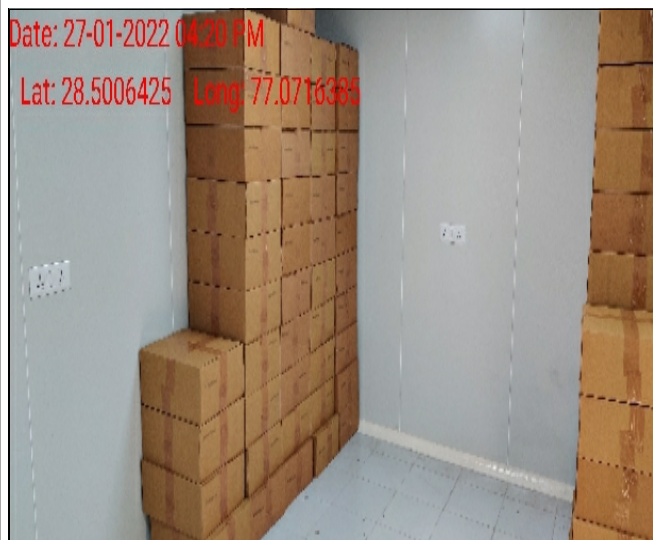
Safe Packaging for Defect Free Delivery of Products