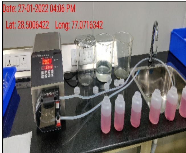
Critical Machine for Production