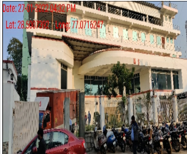
Physical Location: Outside of the Firm