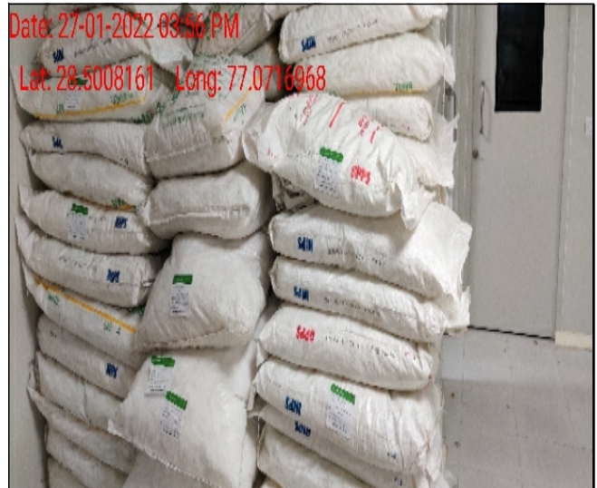
Raw Material Stock